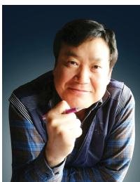
Chairman | Doctor of Economics